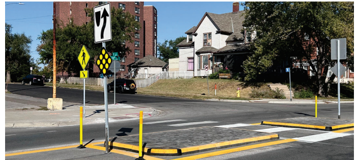
Pedestrian Refuge Islands

Pedestrian Countdown Timers - Pedestrian countdown timers show the number of seconds left to safely cross the street, allowing people to make better decisions on when to cross.