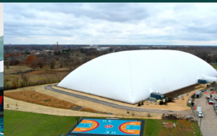
CHANDLER PARK FIELDHOUSE