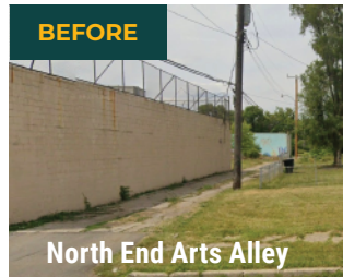
North End Arts Alley