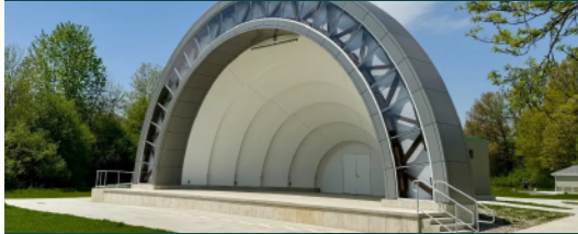
PALMER PARK BANDSHELL