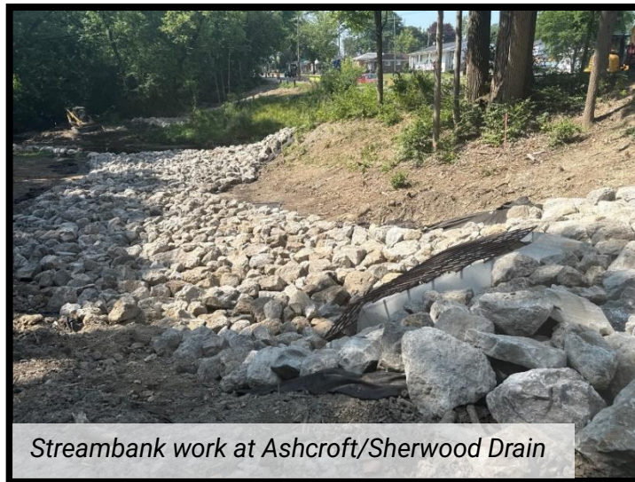
Streambank work at Ashcroft/Sherwood Drain

Work along West Parkway is almost done. Sewer installation is complete, and roadway restoration efforts are underway. Major is continuing work on the streambank at the Ashcroft/Sherwood Drain which is the stream near West Parkway and Meadow Park that flows east and connects to the Rouge River.