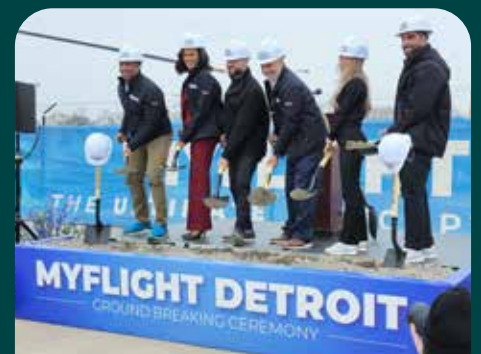
MAYOR MICHAEL DUGGAN CITY COUNCIL MEMBER SCOTT BENSON CITY COUNCIL MEMBER LATISHA JOHNSON CITY COUNCIL MEMBER COLEMAN A. YOUNG II

The new development represents the airport's expanded role to include a destination for tourism, leisure, and economic revitalization. MyFlight Tours' facility is set to include a modern hangar to support its expanding helicopter fleet and a public-facing entertainment space aimed at enhancing the visitor experience.