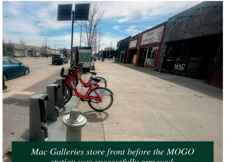
Mac Galleries store front before the MOGO station was successfully removed.