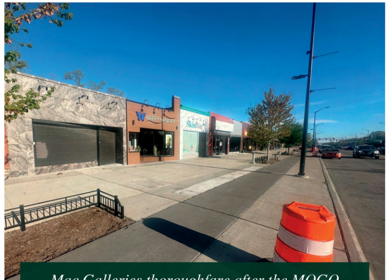
Mac Galleries thoroughfare after the MOGO station was successfully removed.