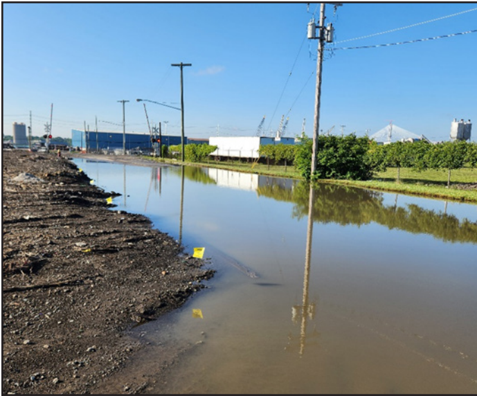
Project Area Flooding