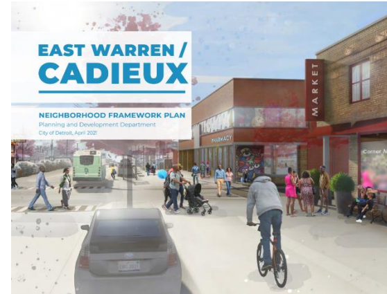
Example: East Warren/Cadieux Neighborhood Plan