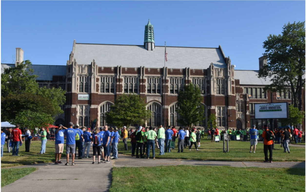
Durfee Innovation Center - 2470 Collingwood St.

The Durfee Innovation Center, the former Durfee Elementary School, has been repurposed by Life Remodeled, a local non-profit organization providing office and event space to smaller local non-profits serving as a non-profit incubator in the heart of the Dexter-Linwood neighborhood (minutes from RWNP). This space is occupied by 35 nonprofit businesses/organizations offering needed community resources to approximately 22,000 Detroiters annually.