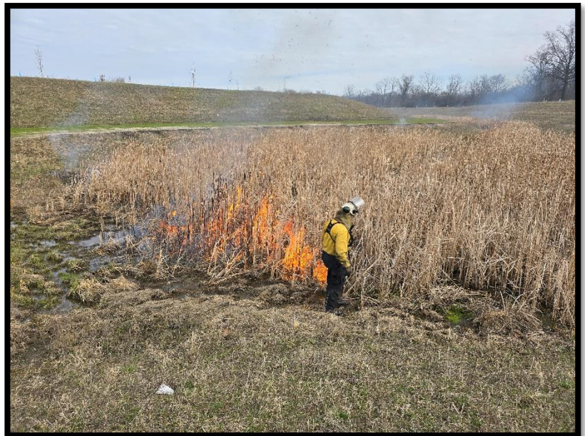
Prescribed Burn in Rouge Park – April 9, 2025

DWSD contractors will conduct a plant survey this summer to evaluate the effectiveness of the prescribed burn and determine what additional maintenance efforts may be needed.