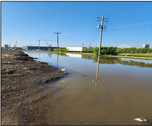
Project Area Flooding