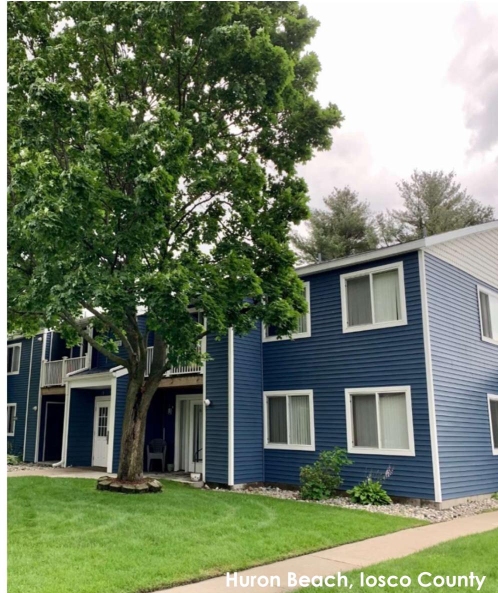
Huron Beach, Iosco County