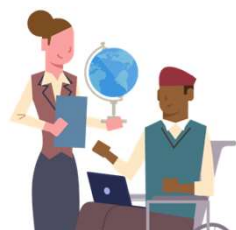
Teachers & Librarians