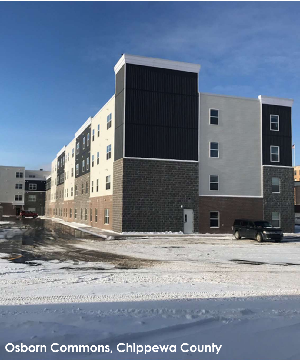
Osborn Commons, Chippewa County