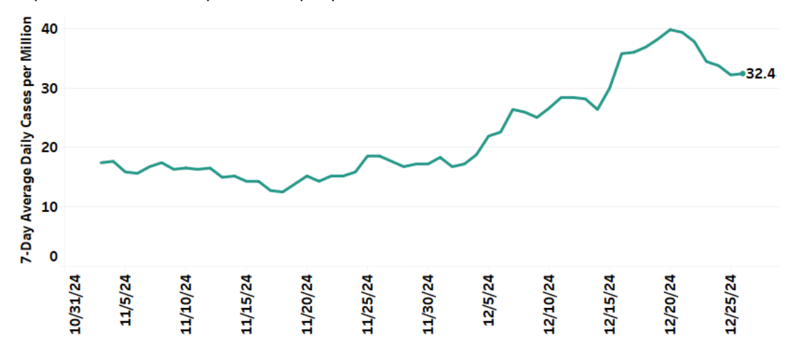
Figure 1: COVID-19 confirmed (daily/1,000,000) cases

The 7-day average rate of new confirmed COVID-19 cases among City of Detroit residents is 32.4 daily cases per million people as of 12/26/2024. This has increased compared to the previous report, when it was reported as 24.4 cases per million people.