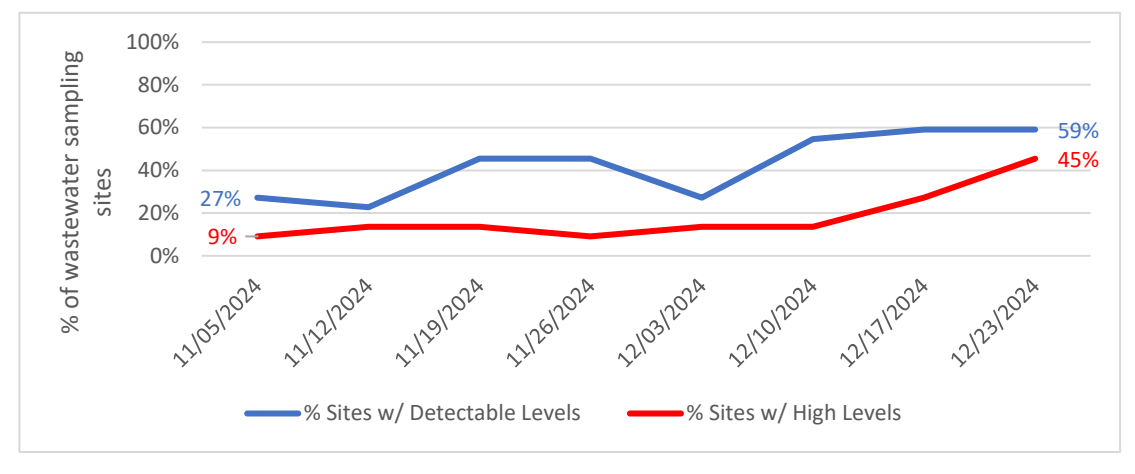
Figure 4: SARS-CoV-2 Wastewater Levels

The proportions are out of 22 sites across the city of Detroit from which wastewater samples are taken and tested for SARS-CoV-2 markers. Each sampling site represents a specific population based on the area its sewer shed covers, such as long-term care facilities, college dormitories, and entire ZIP code areas. Detectable levels are over 1000 copies/100mL; high levels are over 5000 copies/100mL.