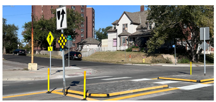
Pedestrian Refuge Islands

Pedestrian Countdown Timers- Pedestrian countdown timers show the number of seconds left to safely cross the street, allowing people to make better decisions on when to cross.