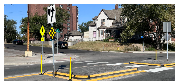
Pedestrian Refuge Islands

Pedestrian Countdown Timers- Pedestrian countdown timers show the number of seconds left to safely cross the street, allowing people to make better decisions on when to cross.