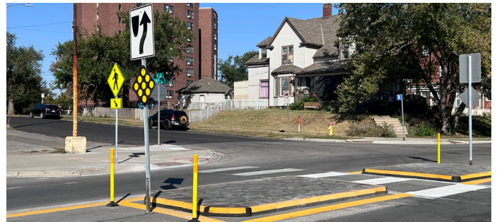
Pedestrian Refuge Islands

Pedestrian Countdown Timers - Pedestrian countdown timers show the number of seconds left to safely cross the street, allowing people to make better decisions on when to cross.