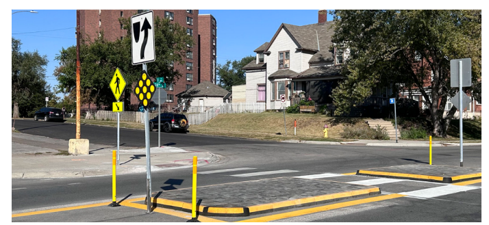
Pedestrian Refuge Islands

Pedestrian Countdown Timers - Pedestrian countdown timers show the number of seconds left to safely cross the street, allowing people to make better decisions on when to cross.