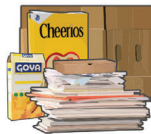
Cereal Boxes, Newspaper, Magazines and Mail, Flattened Cardboard & Paper Tubes