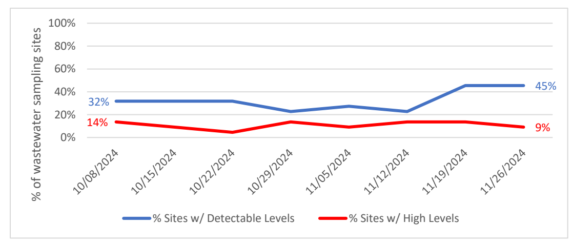
Figure 4: SARS-CoV-2 Wastewater Levels

The proportions are out of 22 sites across the city of Detroit from which wastewater samples are taken and tested for SARS-CoV-2 markers. Each sampling site represents a specific population based on the area its sewer shed covers, such as long-term care facilities, college dormitories, and entire ZIP code areas. Detectable levels are over 1000 copies/100mL; high levels are over 5000 copies/100mL.