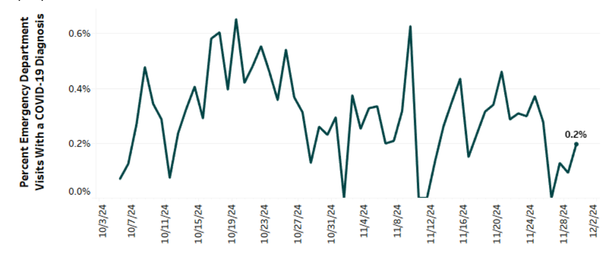
Figure 2: Syndromic Surveillance COVID-19 Diagnoses

There are 0.2% of Emergency Department visits in Detroit with diagnosed COVID-19 as of 11/30/2024.