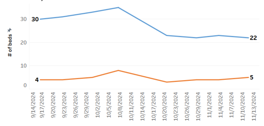
Figure 3: COVID-19 hospital occupancy

There are currently 22 COVID-19 occupied inpatient beds and 5 COVID-19 occupied ICU beds recorded in the city of Detroit.