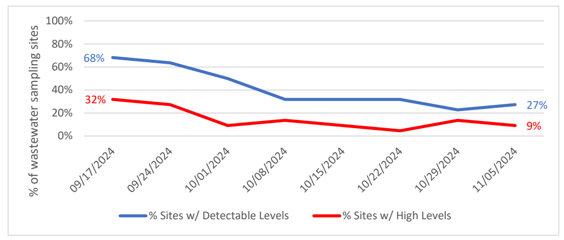
Figure 4: SARS-CoV-2 Wastewater Levels

The proportions are out of 22 sites across the city of Detroit from which wastewater samples are taken and tested for SARS-CoV-2 markers. Each sampling site represents a specific population based on the area its sewer shed covers, such as long-term care facilities, college dormitories, and entire ZIP code areas. Detectable levels are over 1000 copies/100mL; high levels are over 5000 copies/100mL.