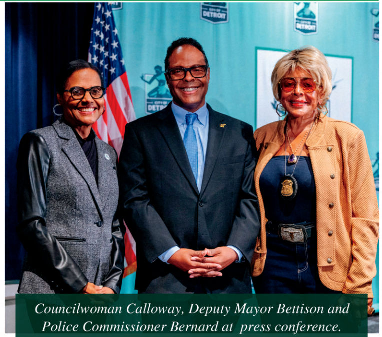
Councilwoman Calloway, Deputy Mayor Bettison and Police Commissioner Bernard at press conference.