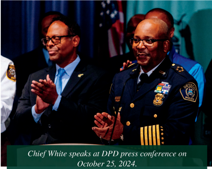
Chief White speaks at DPD press conference on October 25, 2024.