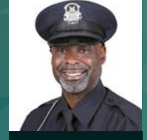
NPO Charles Rodgers