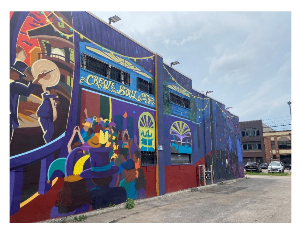
Mural painted on the east façade of the building but not included in the permit application

While reviewing the refuse area, CPC staff noted that the brick masonry walls found near the refuse area were not constructed according to the submitted plan. This raises concerns about the disposal process, as it appears that a waste collector may not be able to fit through the designated area.