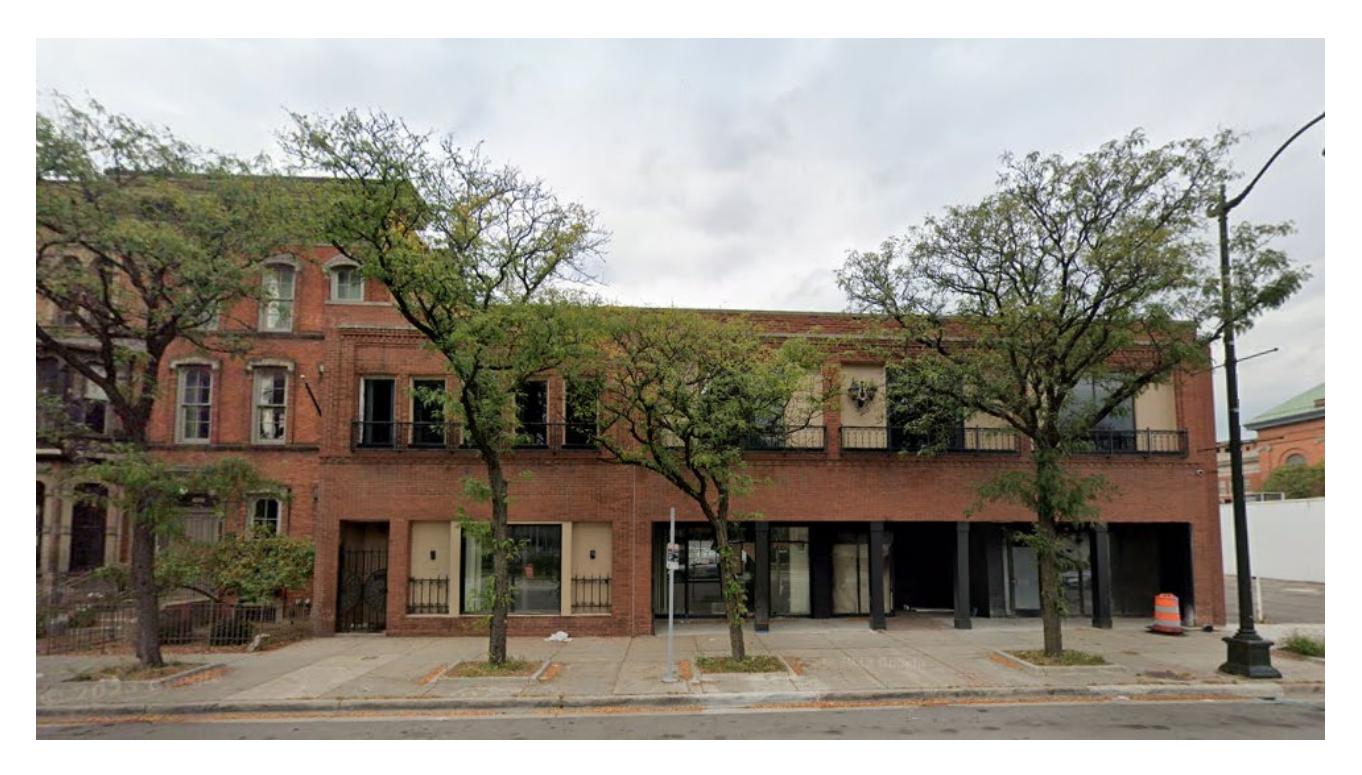
Front façade of the building facing Jefferson circa October 2023

Between 2020 and 2023, 557 E. Jefferson Avenue transitioned in ownership with the aim to redevelop the site as a new restaurant and bar facility with minor changes to the exterior façade. The proposed development is seeking to add new roof deck dining with surrounding rooftop railing, standing at a height of four feet. An initial PCA District Review was conducted by staff where questions regarding signage and refuse area were indicated and inquired by staff to the applicant, KM Consultants, on May 22<sup>nd</sup>, 2024. KM Consultants expressed their belief that the PCA review had been completed and approved due to the lengthy duration of the process. However, there has been no action by the council nor any contact with CPC staff indicating that the review process was completed. Furthermore, no permits have been issued for this project. On the May 22<sup>nd</sup> email chain KM Consultants stated that they would follow up with the operator to obtain information on any signage and verify if any changes are proposed to the exterior facade.