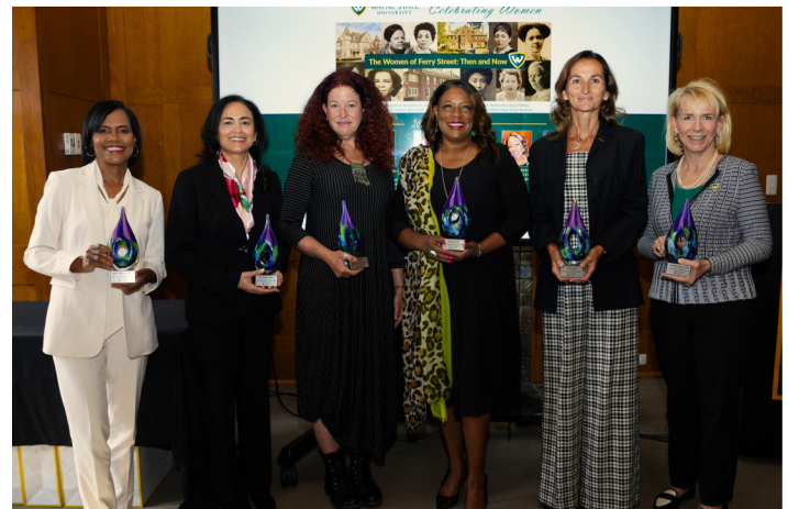
“The Women of Ferry Street: Then and Now” 2024 honorees.