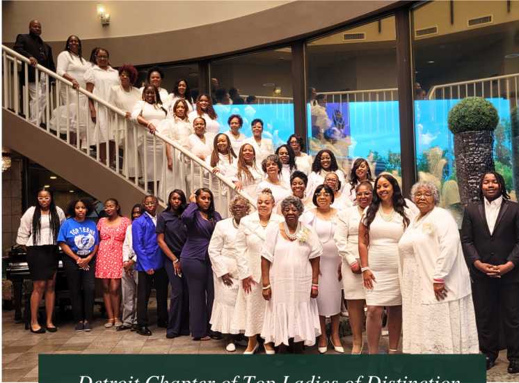
Detroit Chapter of Top Ladies of Distinction