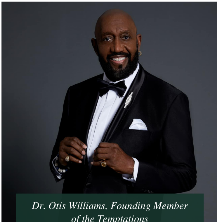
Dr. Otis Williams, Founding Member of the Temptations