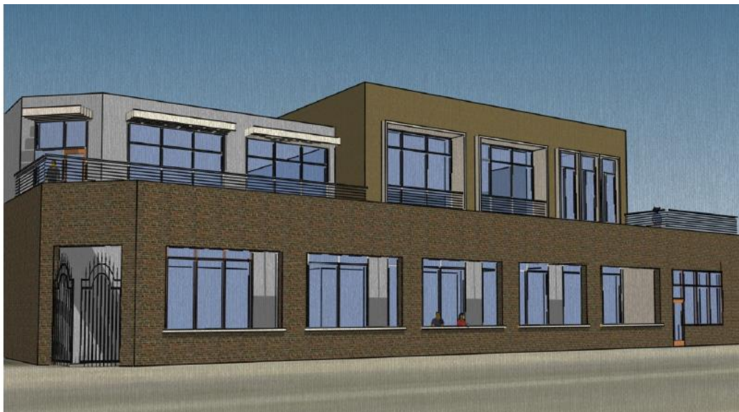
Rendering of completed project at 7326 W McNichols 8