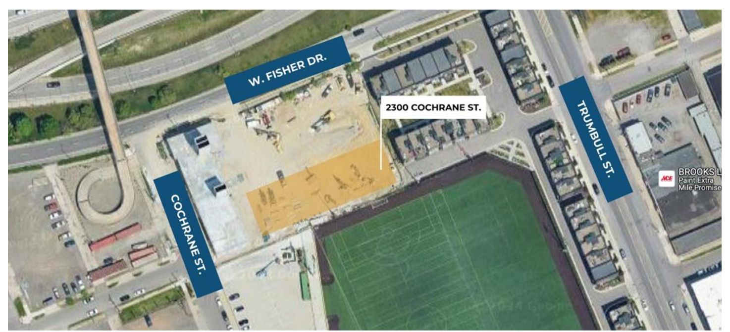
Map of Area<sup>18</sup>