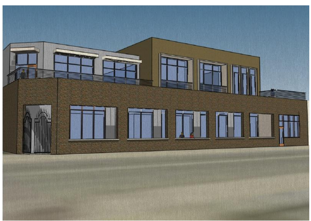
Rendering of completed project at 7326 W McNichols<sup>13</sup>