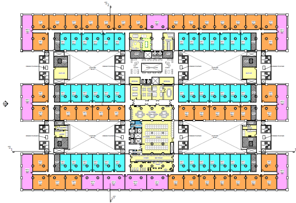
FIFTH FLOOR PLAN SCALE: 1/8" = 1'-0"