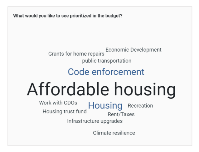
Figure 1. Question 1 launched in the Slido platform

The first question was structured as a word cloud, which showed the most frequently stated responses in larger-sized text, and lesser-given answers in smaller-sized text (see Figure 1).