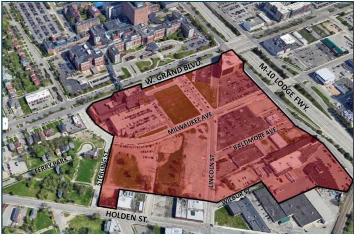
Proposed rezoning footprint