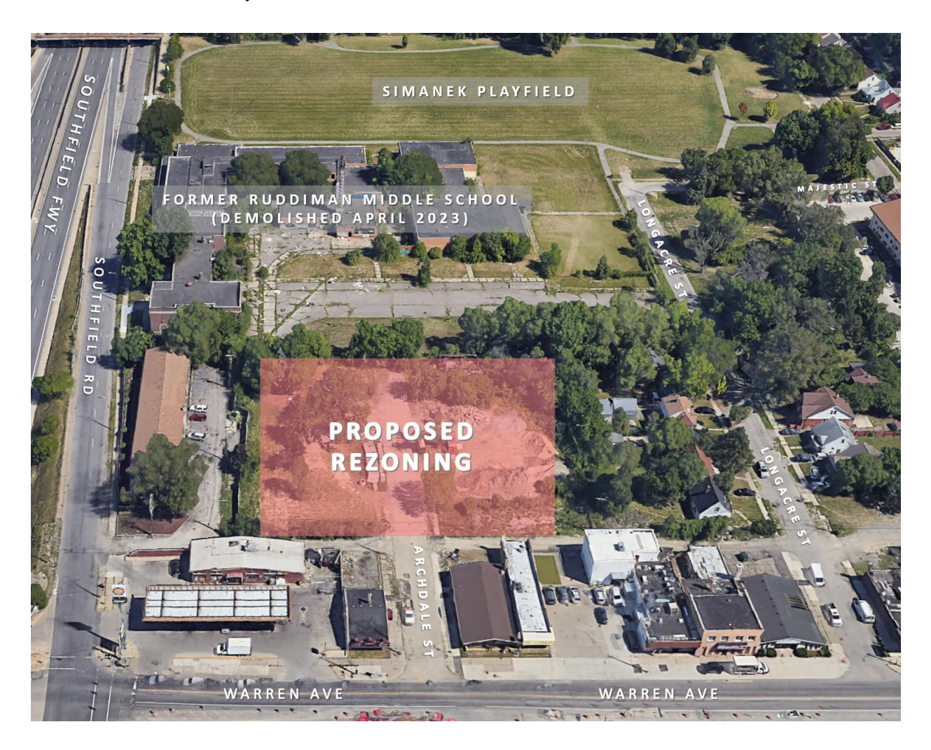
View of proposed rezoning