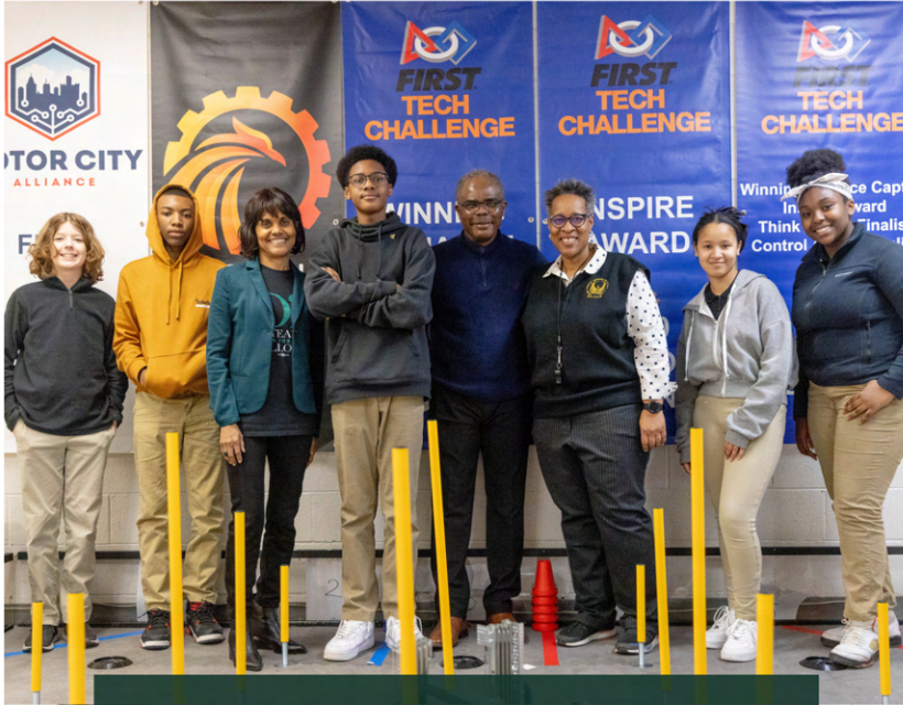
Techno Phoenix Robotics Team at FLICS