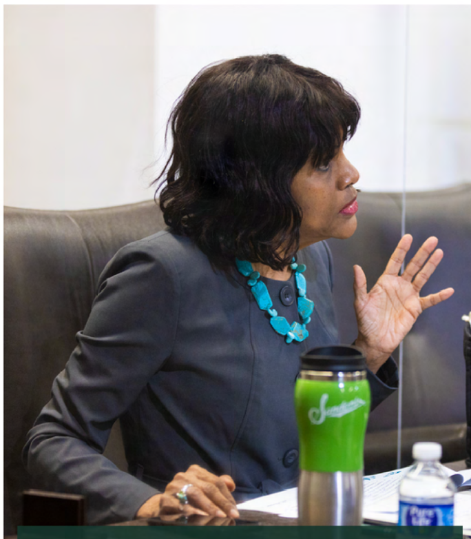
Mayor's budget address to City Council

The City of Detroit's budget is from March 13-29, public hearings on the budget are on April 3, and the City Council will vote on the budget April 10. For more information visit detroitmi.gov/budget