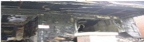
5352 Allendale1 6_22_23

Certified as Detroit Based, Small, & Minority-Owned Business until 9/30/23. Vendor indicates a Total Employment of 8; 8 Employees are Detroit residents.