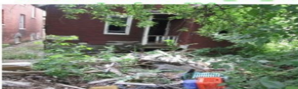
5352 Allendale4 6_22_23