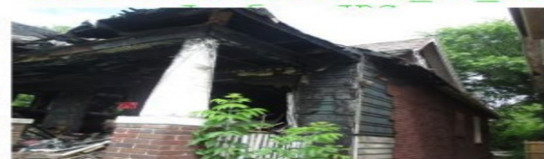
5352 Allendale5 6_22_23