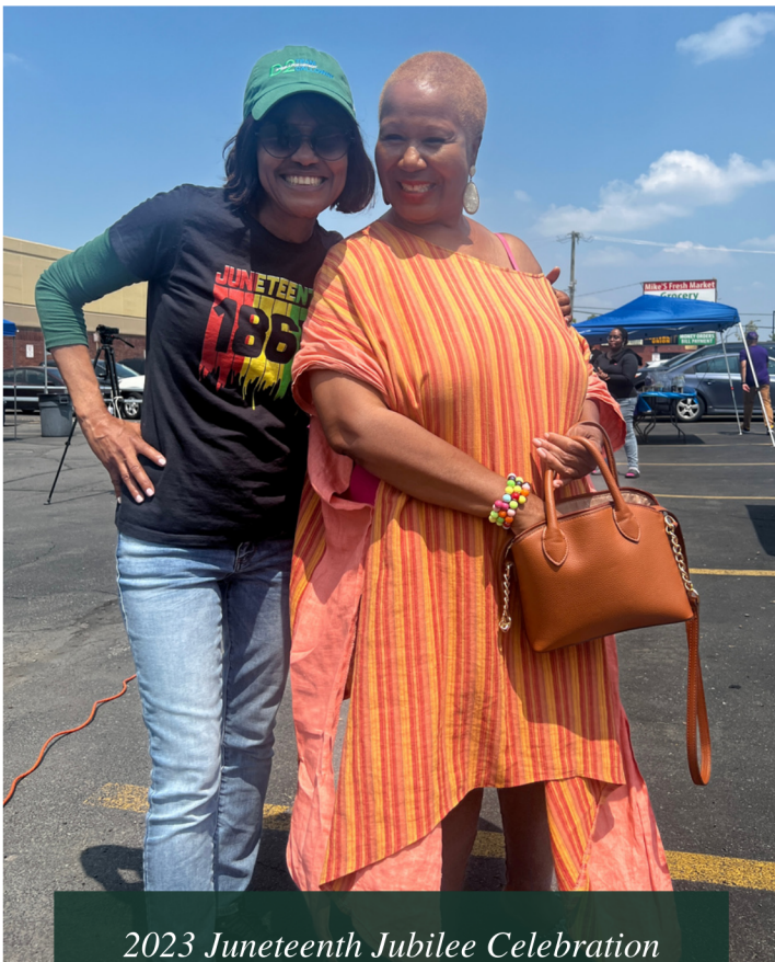
2023 Juneteenth Jubilee Celebration