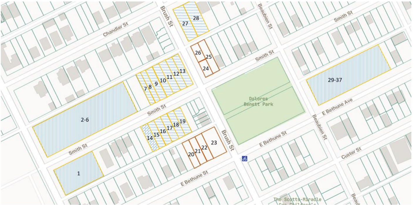
Location Map 9