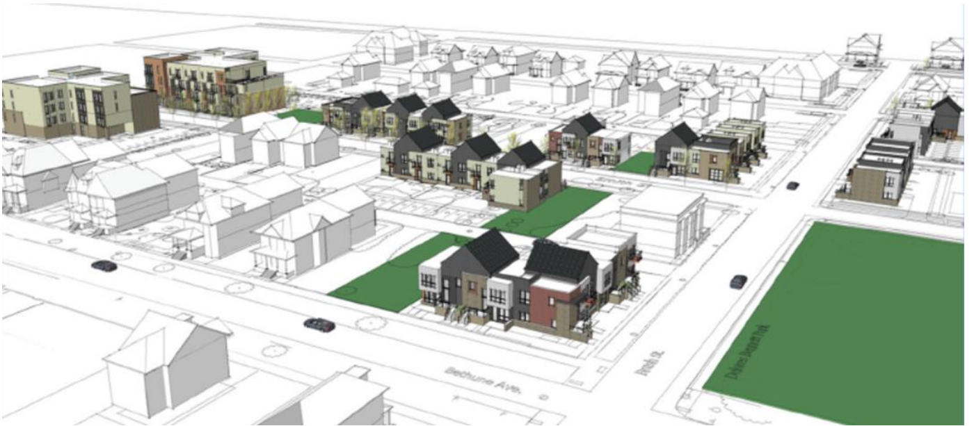
Rendering of North End Landings