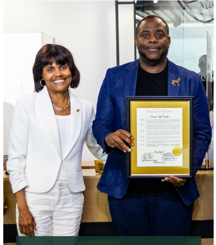
Formal Session on May 30, 2023