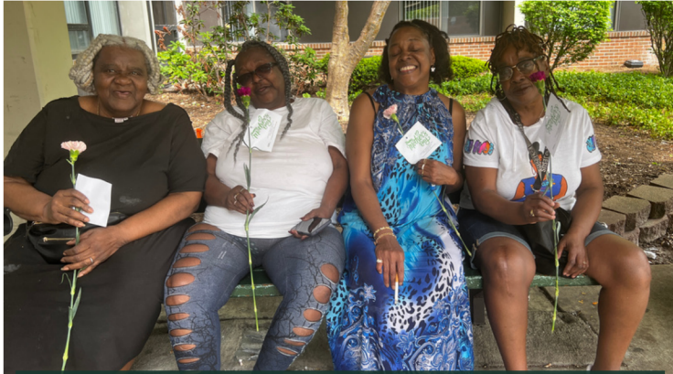
Mother's Day Flower Distribution on May 12, 2023