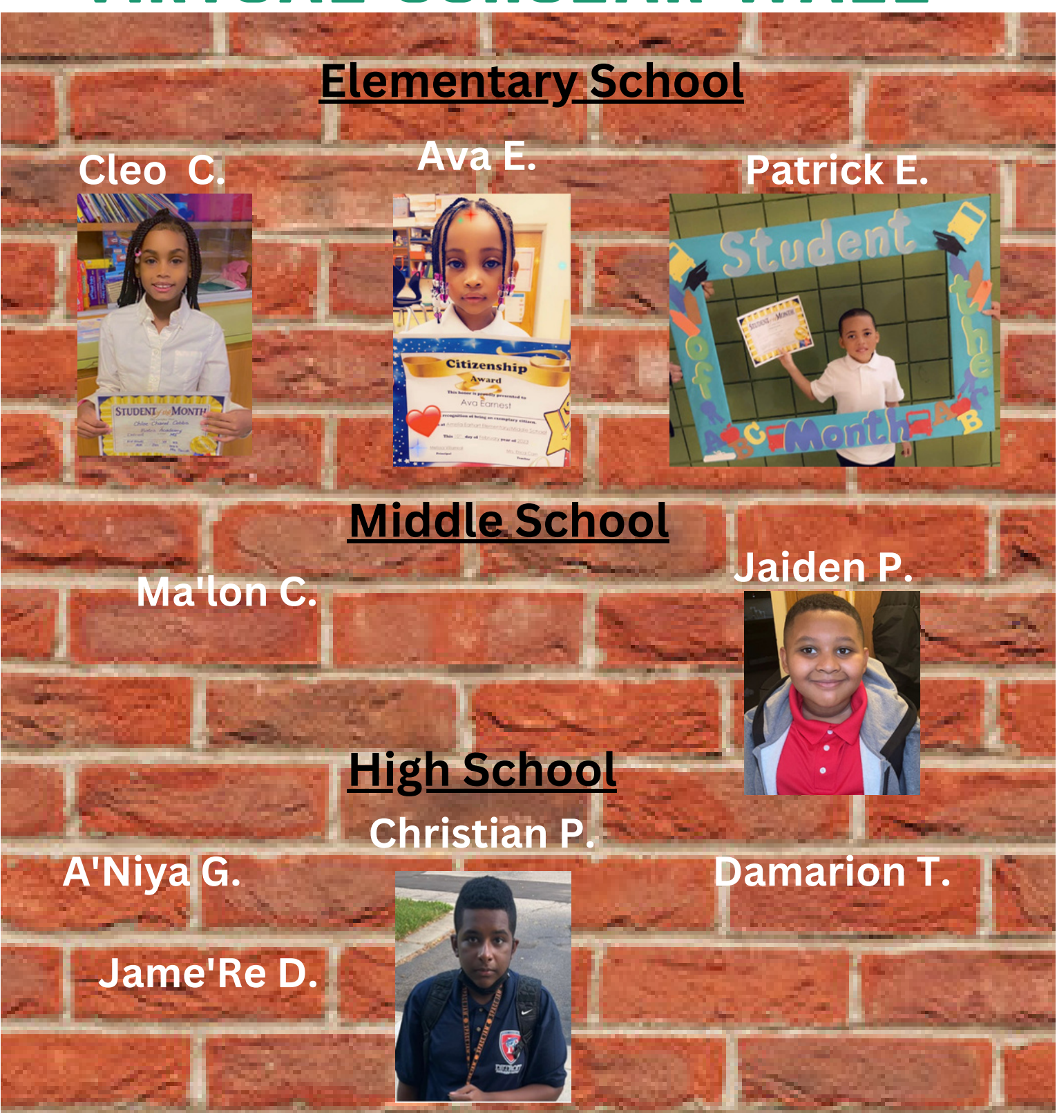
Help us congratulate these scholars! If you want to see your child's name added to this wall, send us a copy of their report card so we can highlight their accomplishments!