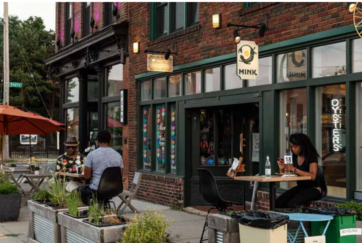
CITY OF DETROIT | COVID OUTDOOR SEATING GUIDELINES 9