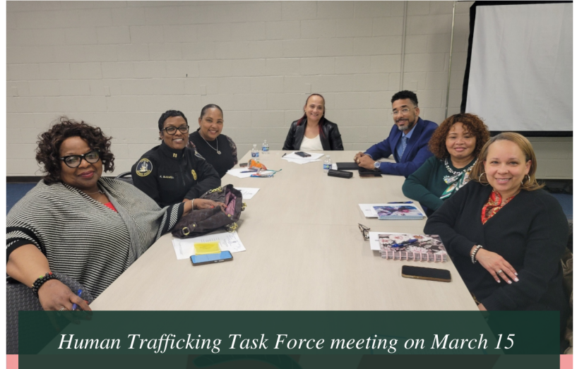
Human Trafficking Task Force meeting on March 15