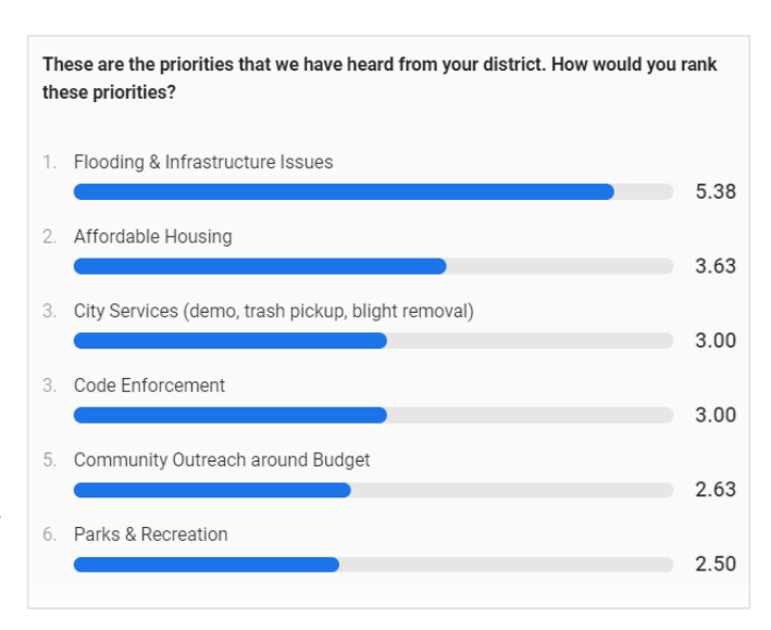
Figure 2. Question 2 launched in the Slido platform

The third and final question was structured to be open-ended and showed responses as a thread of comments (see Figure 3 ).