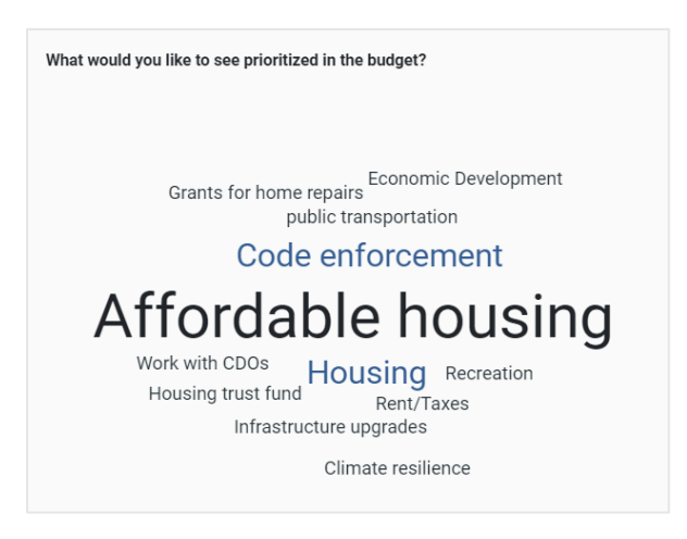
Figure 1. Question 1 launched in the Slido platform

The first question was structured as a word cloud, which showed the most frequently stated responses in larger-sized text, and lesser-given answers in smaller-sized text (see Figure 1).