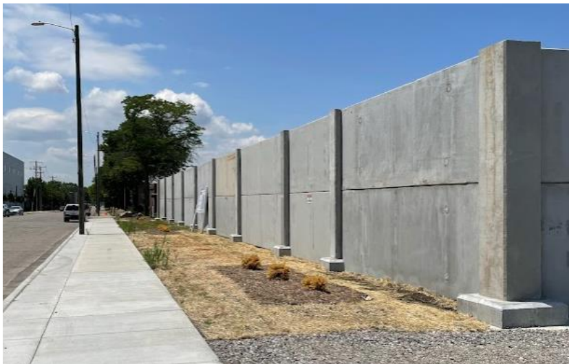
South wall on Porter St

~188' x 12' (no paint on gates, doors, signs etc)