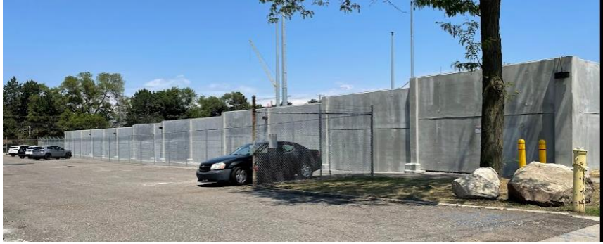
West facing wall