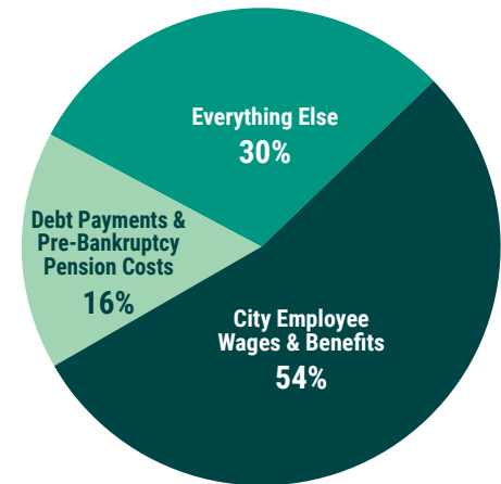
FY23 Adopted Budget - General Fund ($1.2 billion)