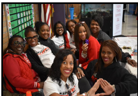
D.I.V.I.N.E. 49 Spring 2014 SAC