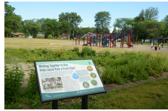
Install rain gardens and trees