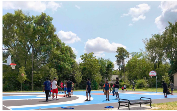
Resurface and/or paint existing courts, play areas and walking loop