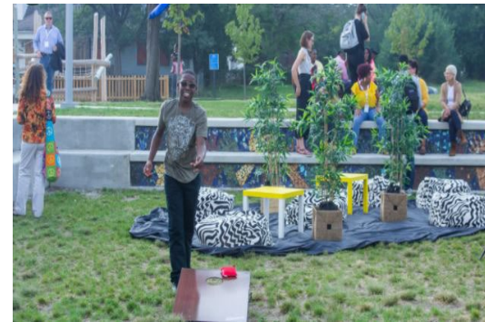
Create smaller gathering spaces and picnic areas through topography, furniture, and tree plantings