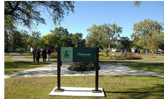
Better define gateways, entrances, edges and pathways with signage & planting