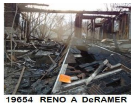
19654 RENO A DeRAMER