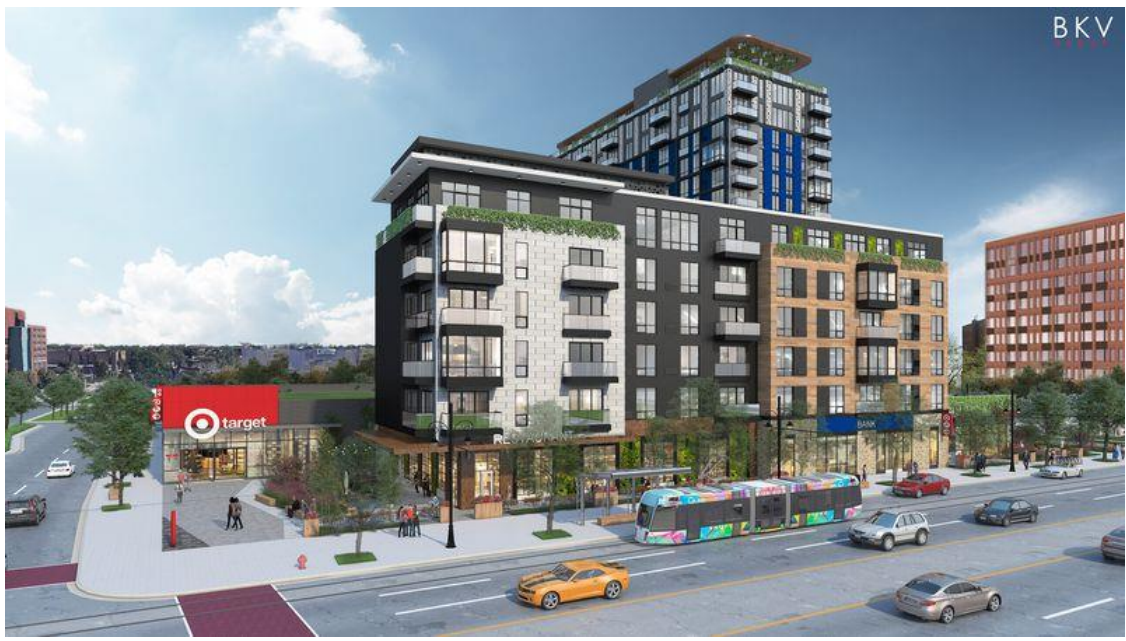
Rendering of the development<sup>13</sup>