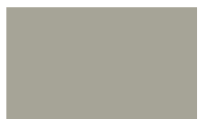
A:2 Light Olive Gray MS: 10Y 6/1