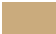
A:5 Grayish Yellow MS: 2.5Y 7/4