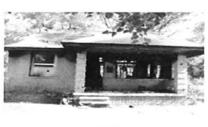
14260 LAMPHERE-10-10-19-A, MESSNER.J PG