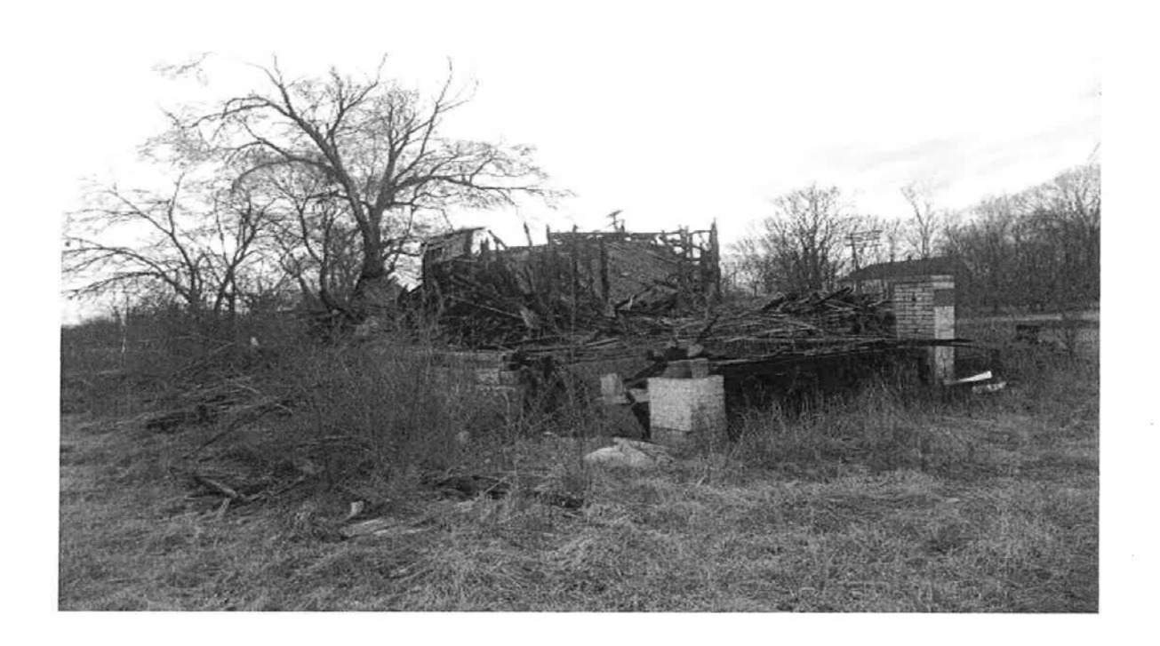
124 GRANDY ST . PG