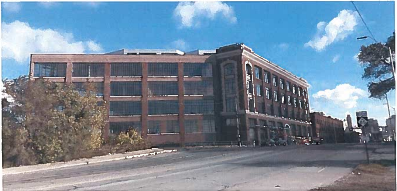
1700 W Fort 3

Please contact us if we can be of any further assistance.