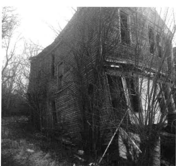
9617 Bessemore D.jpg